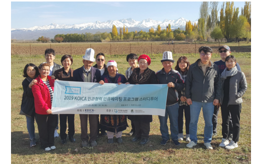
The Kyrgyz Republic Team

“ It was an excellent experience to understand the needed procedure and method when planning a new project abroad. I think it will be a great help to manage my projects in the future. ”