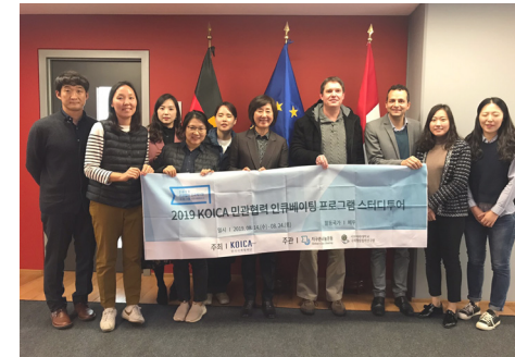
The Republic of Peru Team